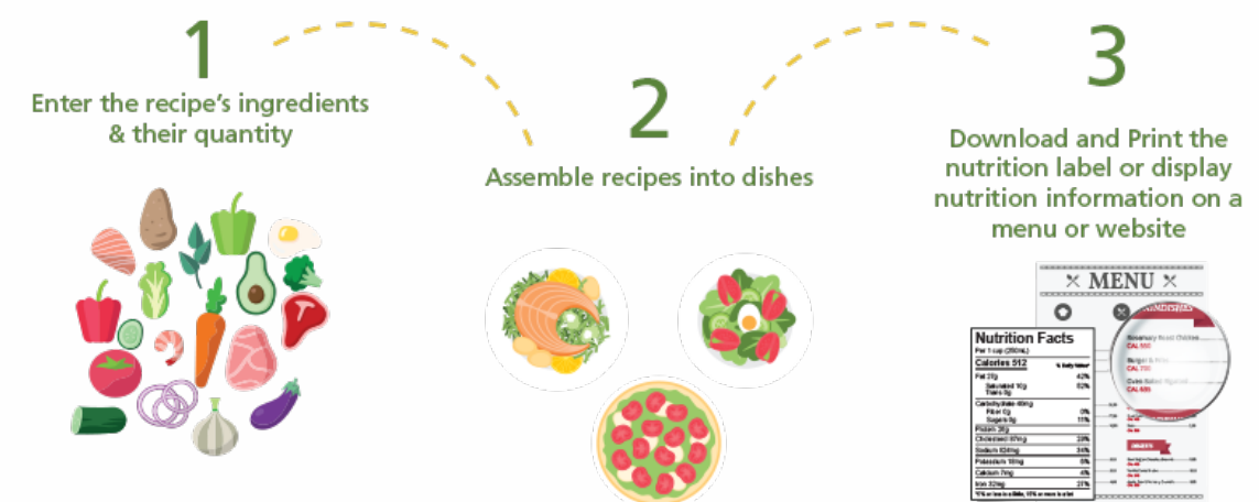
How to MenuSano Works

MenuSano is used globally by restaurants, bakeries, cafes, hospitals, medical clinics, meal kits, food manufacturers, cannabis edibles producers, culinary schools, and other educational institutions.